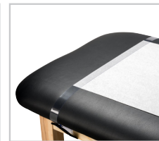
040 Paper Cutter