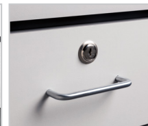
055 Drawer Locks