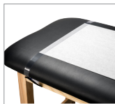
040- Paper Cutter