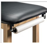
030- Paper Dispenser