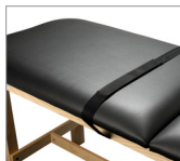
077- Positioning Strap