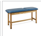
006- Special Length