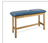
005- Special Height