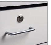
055- Drawer Locks