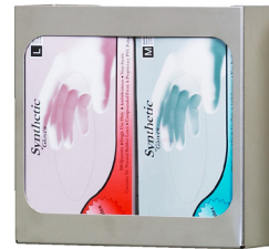
Shown in the horizontal position

*Clinton stainless steel items are not M.R.I. compatible.