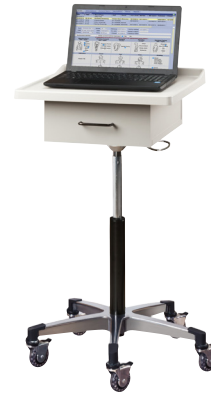
Prop 65 Warning