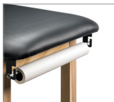
030– Paper Dispenser