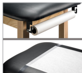
034– Paper Dispenser & Cutter Combo