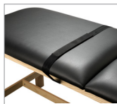
077– Positioning Strap