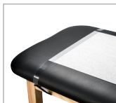
040– Paper Cutter