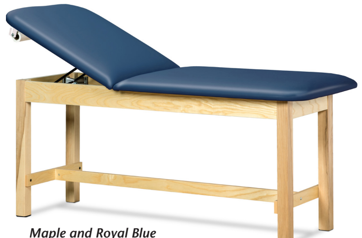
Maple and Royal Blue

California residents please be advised of the following, pursuant to Proposition 65: