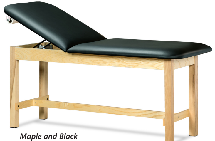
Maple and Black